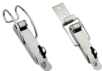
[ DK-8052-1 ]