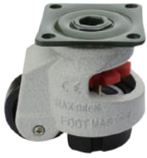
[ GD-F=OWT ]