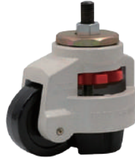
[ GD-S=OWT ]