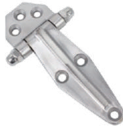
[ OH-0210-S ]