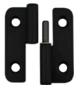
[ OH-044-1R ]