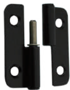
[ OH-044-1L ]