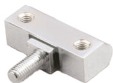
[ OH-211-W ]