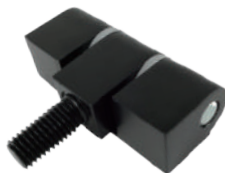
[ OH-211-B ]