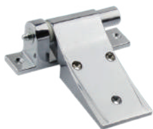
[ OH-215-L ]