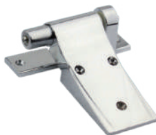
[ OH-215-R ]