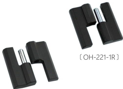
[ OH-221-1R ]