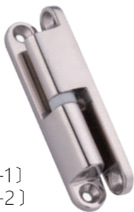
[ OH-2719-1 ] [ OH-2719-2 ] [ OH-2719-3 ]