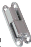
[ OH-2719-4 ] [ OH-2719-5 ]