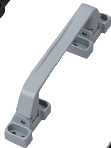
[ TG-807V-G ]