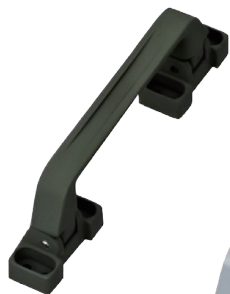
[ TG-807V-S ]