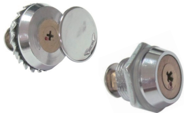
[ TM-014-1 ]