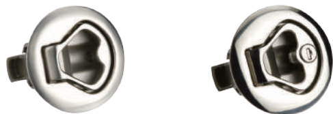
[ TM-308-1 ]