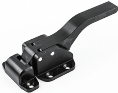
[ TM-6170-1 ]